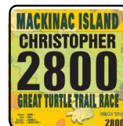
5.7 Mile Walk Bib