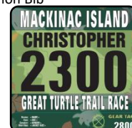
5.7 Mile Run Bib