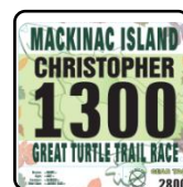
Half Marathon Bib